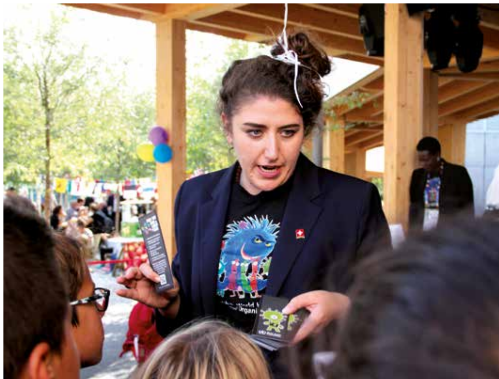
WHO raising awareness on food safety at the 2015 Food Expo Milano.

Therefore, because many food safety risks are under their control, specific food safety risk communication efforts may logically be targeted to women.