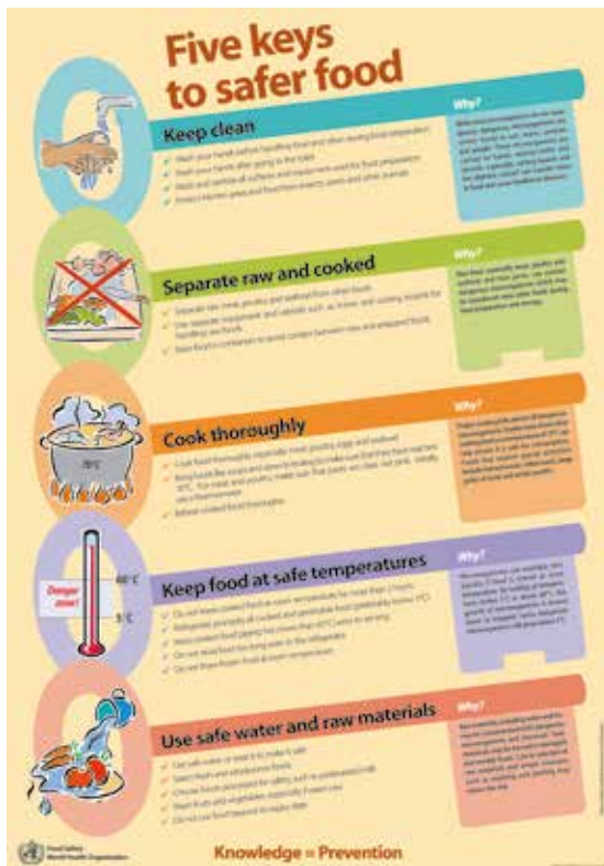
FIGURE 4.1 EXAMPLE OF A GOOD USE OF VISUAL MATERIAL FOR EFFECTIVE COMMUNICATION OF FOOD SAFETY RISK INFORMATION