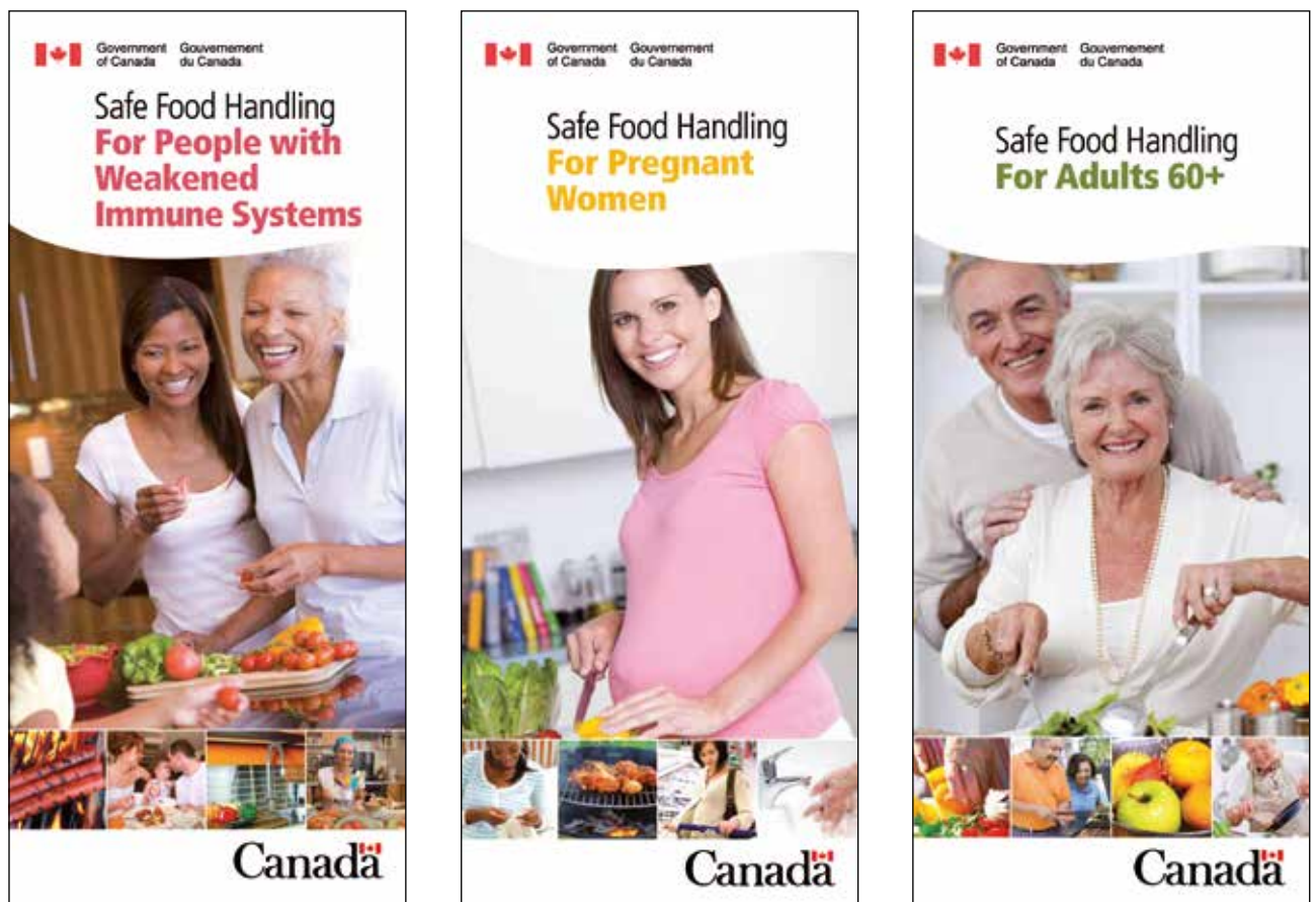
FIGURE 3.1 TAILORING FOOD SAFETY INFORMATION TO DIFFERENT TARGET AUDIENCES

Access to written notices about food safety risks and the ability to read them may vary among populations because of problems with distribution, vision and/or literacy. As a result, communicating about food safety risks in written form only is unlikely to meet the needs of many audiences, even in affluent countries. For these people, risk information needs to be delivered in ways that do not rely on the ability to read (e.g. radio, video/television, podcasts, word-of-mouth, images, stories, songs or acted out in plays or other performances).