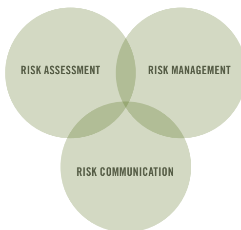
FIGURE 1.1 COMPONENTS OF RISK ANALYSIS

The risk analysis framework is widely adopted globally and is applied to food safety in many countries. The framework consists of three interconnected components: risk assessment, risk management and risk communication (Figure 1.1).