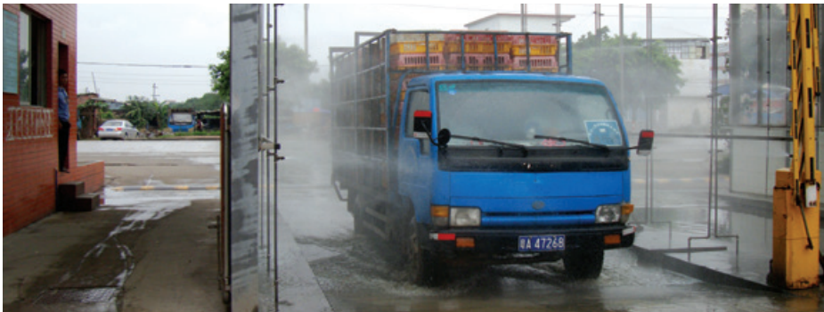
Spraying of poultry with disinfectant.

A full guide to cleaning and disinfection is provided in Annex 1.