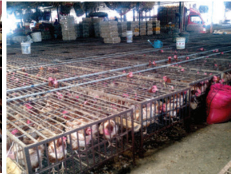
Facilities that can be easily decontaminated.