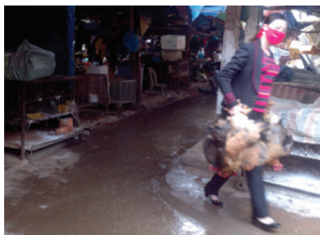
Live poultry being removed from a retail market.

For retail markets, customers should be discouraged from taking live poultry home by promoting hygienic slaughter; (this will not be feasible in very small local markets with no slaughter facilities). If sale of live birds does occur it is essential to have public awareness and training programmes on ways to minimize risk of disease transmission as a result of this practice.