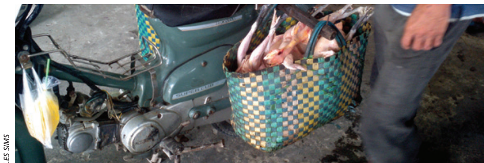
Dressed poultry carcasses being transported from a market to retail outlets resulting in cross-contamination.

Some existing systems of transport of dressed carcasses from slaughter areas to points of sale result in considerable cross-contamination of carcasses. Measures should be introduced to minimize cross-contamination either by using plastic bags for dressed carcasses or by other means of separation (see Annex 1).