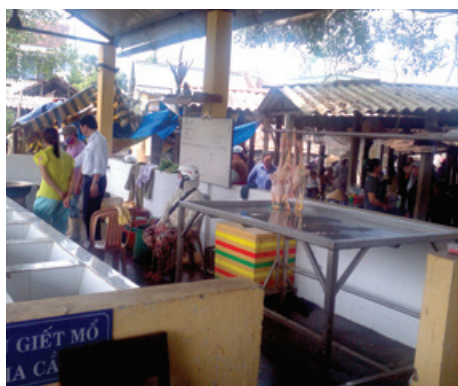
Carcass dressing on the floor; this practice should be phased out.