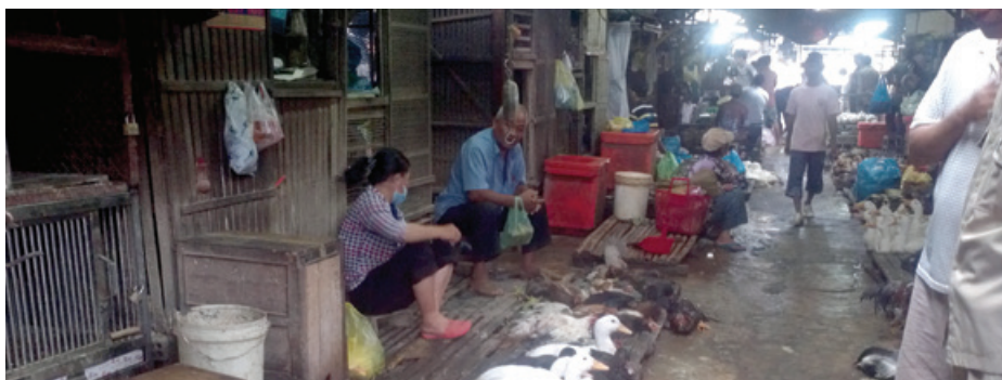
The slaughter area in this market is surrounded by live poultry, and ventilation is poor.