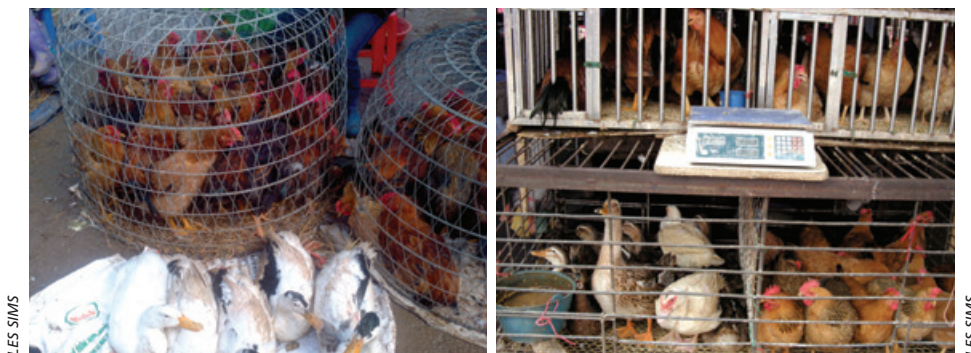
Examples of mixed species trading in retail markets.

“ TRADERS IN MY MARKET SELL DIFFERENT SPECIES OF POULTRY TOGETHER IN THE SAME MARKET STALLS, AND EVEN IN THE SAME CAGES. ”