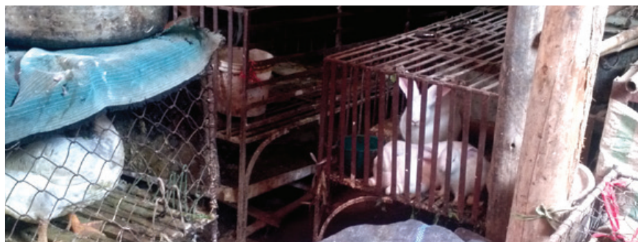
Young ducklings for sale in poultry markets selling mature meat birds.