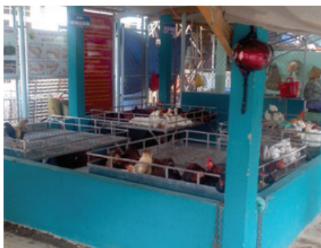
Insufficient separation of poultry from other raw food in a market.